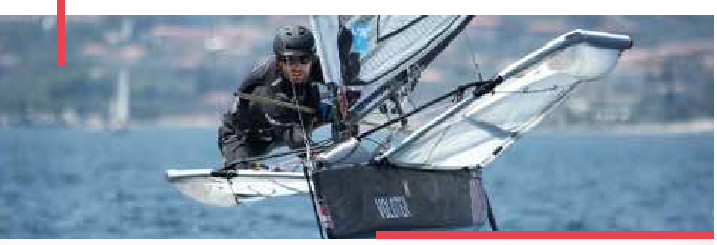
2ND AND 3RD YEAR SPECIALISATION