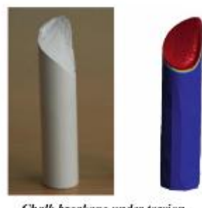
Chalk breakage under torsion

After consulting technology transfer centres, the researchers were able to pinpoint new market potential for this method linked to a new set of technical problems.